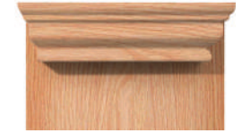
Shown in Amber Glaze