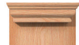
Shown in Amber Glaze

The all new 41 Living Kitchen Beacon takes living space to a whole new level. You'll feel right at home in this Beacon, which offers one full bathroom and a half bathroom, plenty of storage and counterspace in the kitchen. You'll feel like you have endless space to stretch your legs out during a long trip. We've also added additional cabinet space to the living galley, a fireplace to the bedroom suite and a half bath to accommodate whomever you happen to be entertaining.