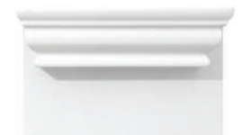
Shown in White Linen