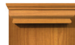
Shown in English Chestnut