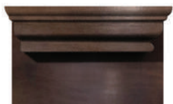
Shown in Mocha

The 42 Rear Kitchen Beacon maximizes available living space in a way that gives all the comforts of home in an innovative new floorplan. From the elevated rear Kitchen with generous counterspace to the comfortable Living Area and Bedroom Suite, this Beacon makes it look easy.