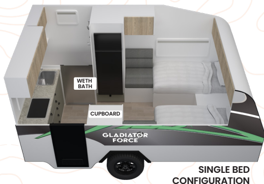
SINGLE BED CONFIGURATION